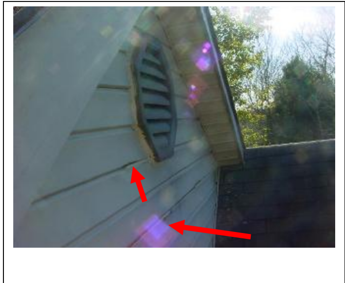
I don't know why the caulking was placed on the vinyl siding joints. Ask the seller.