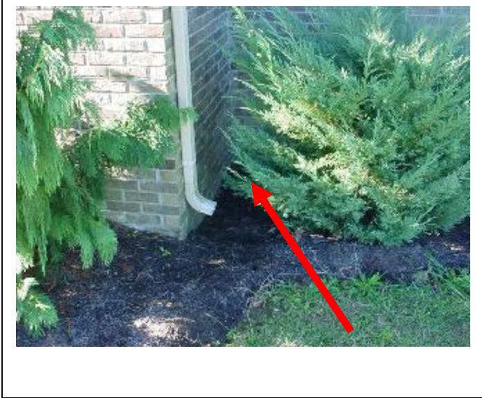
Add leader to this downspout and soil to the corner to allow the water to drain away from the structure.