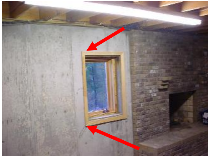
Typical cracks at top & bottom of left side basement window.