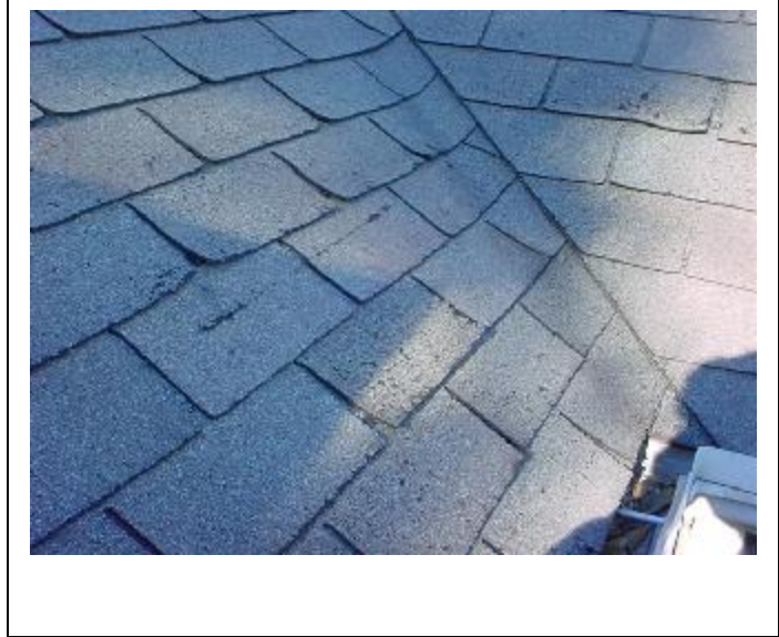
The cupping and curling shown here are signals that the shingles are nearing the end of their design life.