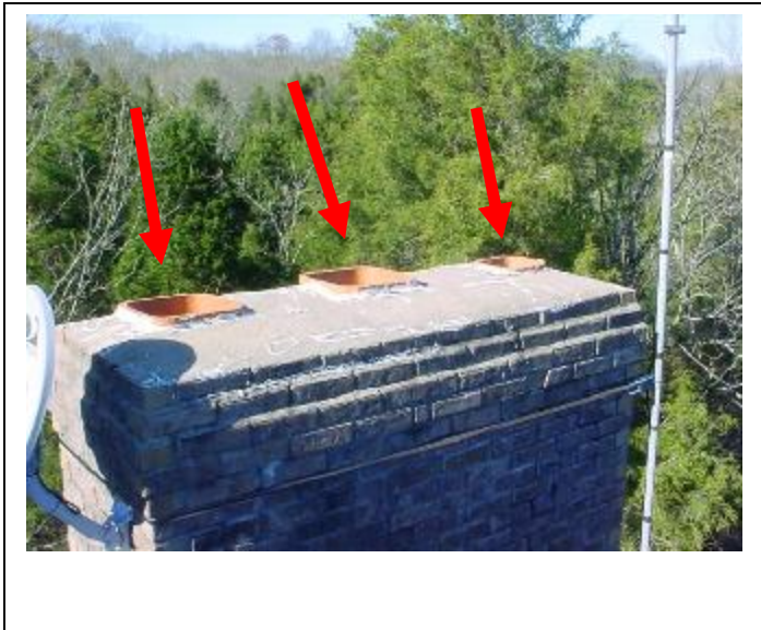
I recommend installation of rain caps on these chimney flues to prevent water getting into the fireplaces.