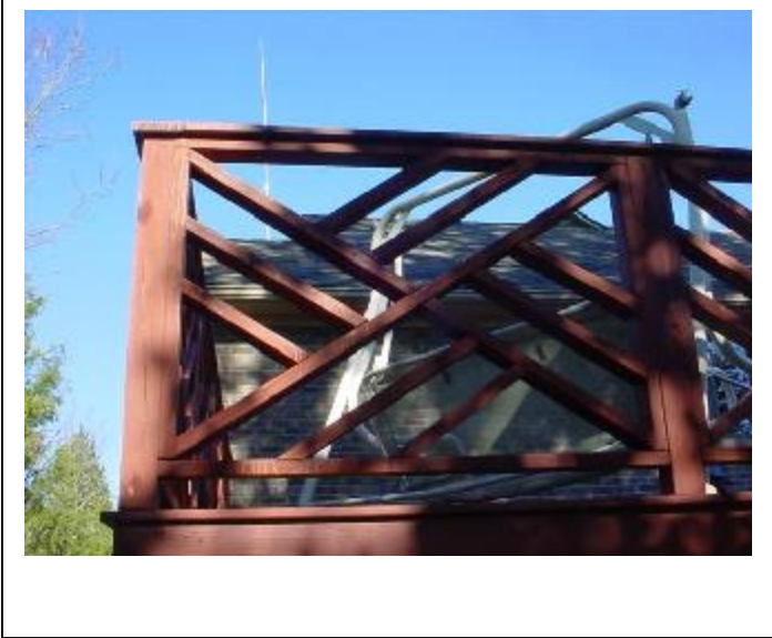
This deck rail creates a climbable ladder effect.