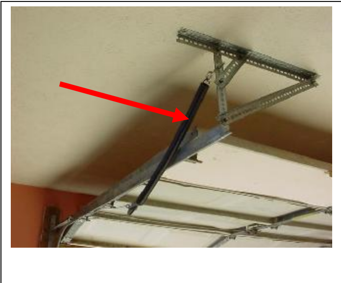
The overhead door springs should have a safety cable ran thru them in case they break.