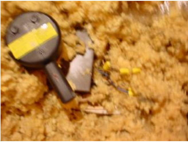
Unsafe electrical splice in attic at bathroom vent fans. Splice should be in covered junction box.