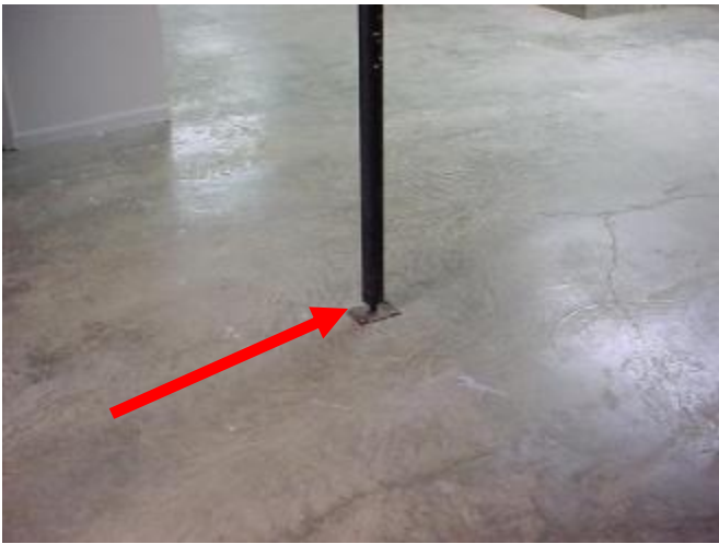
See notes under Structure – Piers/Posts about these steel columns.