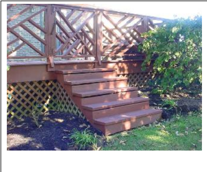
The deck steps should have a grippable handrail installed for safety.