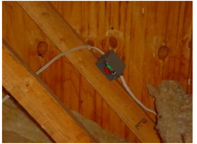
Uncovered junction box at rear wall of gable over dining room.