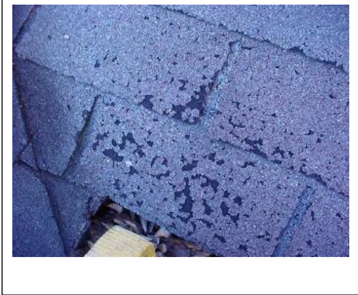
The deterioration shown here signals that the shingles are nearing the end of their design life.