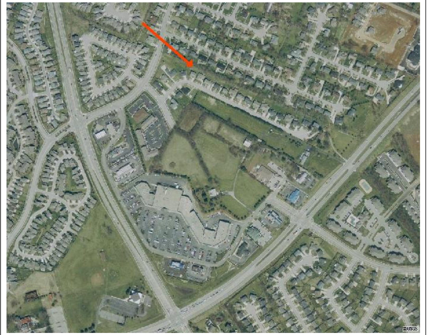
2002 Aerial Photo 123 Your Street Any Town, KY