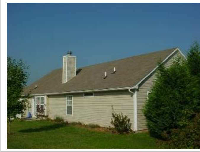
Rear / side view of home.