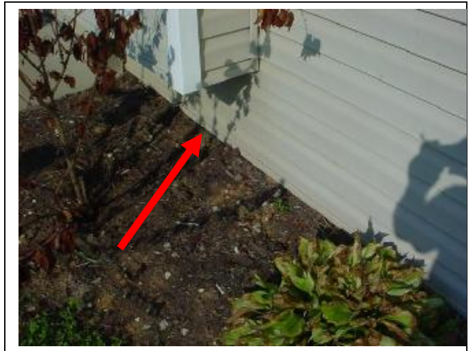
Soil/mulch too close to the siding. Lower the soil/mulch level.