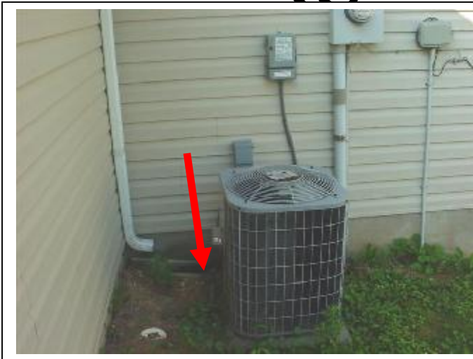
Holes next to foundation need to be filled in. Splash block needs to be turned around.