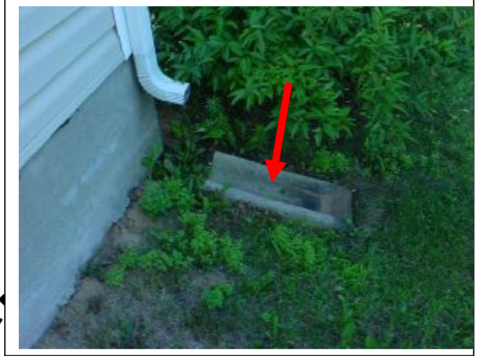
Splash blocks are installed backward.