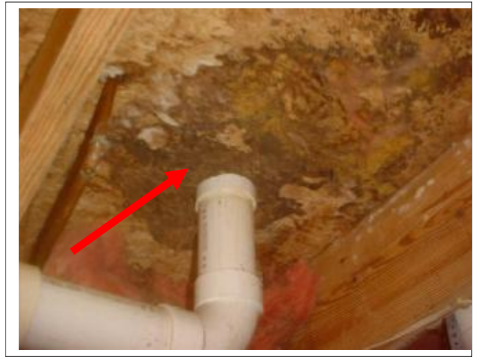
Purple stains indicate leaking under the toilet in the master bathroom.